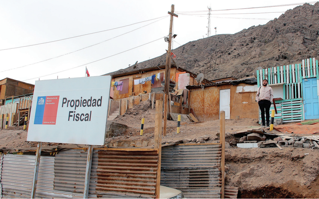
Immigrant camp in Antofagasta - Chile

Commercial development and migration have turned the city of Antofagasta into an epicenter of cultural diversity. As such, some important new phenomena have occurred within the local society, such as the emergence of new family configurations or children of foreigners being given access to public schools. But in other areas, such as housing or work, the new inhabitants are discriminated against, and on certain occasions they aren't able to fully integrate into society due to their vulnerable social status. The artist-in-residence can experience this reality firsthand, visiting migrant camps and speaking with people from different countries that currently live and work in the one of the cities with the highest rate of immigration in Chile.