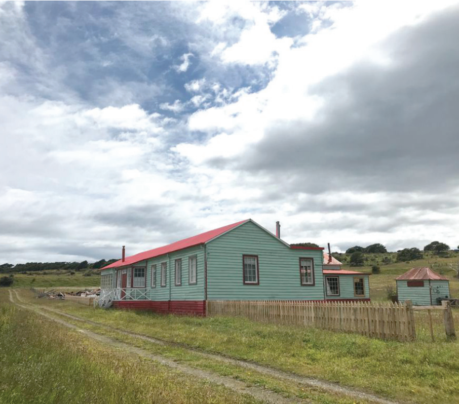
CAB Residence: Alberto Baeriswyl House Museum

Residency program with a focus on the far reaches of the country. In collaboration with the Casa Museo Alberto Baeriswyl (CAB), for ten days the artist will visit one of the southernmost parts of the planet, in a place far away from any other human settlement, an invitation to explore and get to know the wild nature all around. The second part of the residency takes place for the same period of time in Antofagasta, a place that is a complete opposite, where the most pristine skies in the world converge with the driest desert on earth.