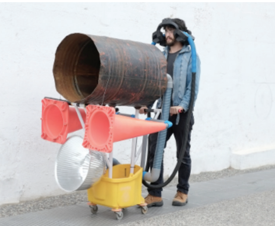
BASE Residence: Sound Art Festival (TSONAMI)

Valparaíso is a city that lives and breathes art. Its streets are an endless source of attraction and inspiration for both artists and their public, turning this important port in the middle of the country into a focal point for cultural events. SACO has collaborated with two of these yearly events in the development of residencies that allow the artist to immerse in the “porteña” culture and tradition. These are: