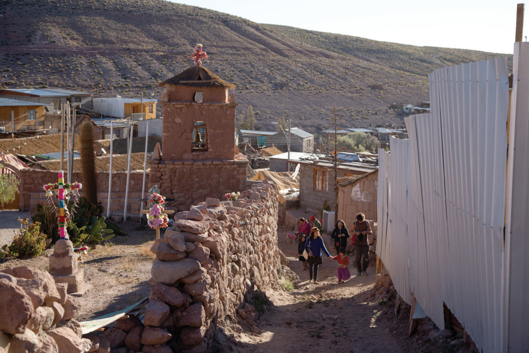
The oases: Rediscovery of ancient settlements