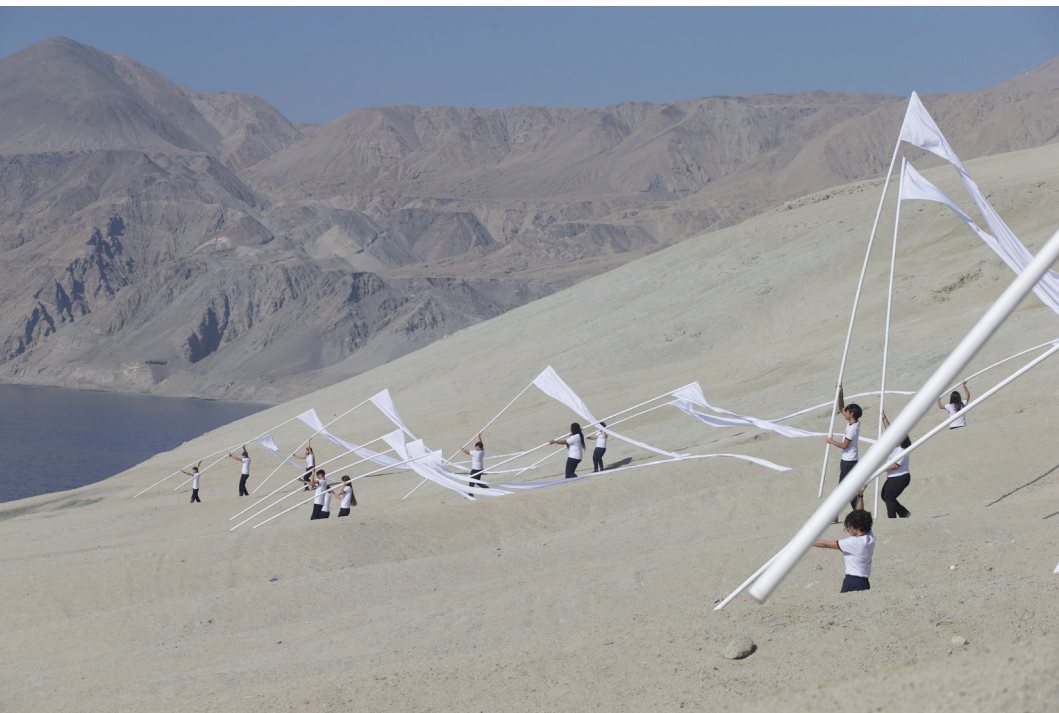
The immensity: Large scale creation from literally nothing